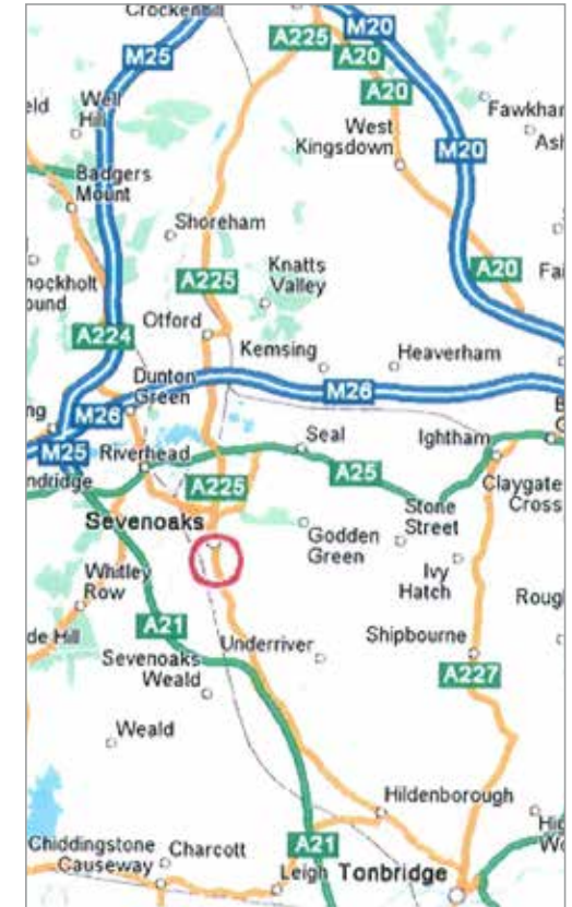
Map © Tele Atlas / © 2007 Crown Copyright

Fast trains run from London Charing Cross, London Waterloo East and London Bridge (approx. 30 minutes) as well as from the Channel Ports and Ashford International with its Eurostar connections. Sevenoaks Station is within walking distance (15–20 minutes) of the school and taxis are available at the station.